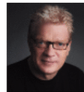
Sir Ken Robinson is an internationally recognized leader in the development of creativity, innovation, and human resources; www.sirkenrobinson.com .

The regime of standardized testing has led us all to believe that if you can't count it, it doesn't count. Actually, in every creative approach some of the things we're looking for are hard, if not impossible, to quantify. But that doesn't mean they don't matter. When I hear people say, "Well, of course, you can't assess creativity," I think, "You can—just stop and think about it a bit." EL